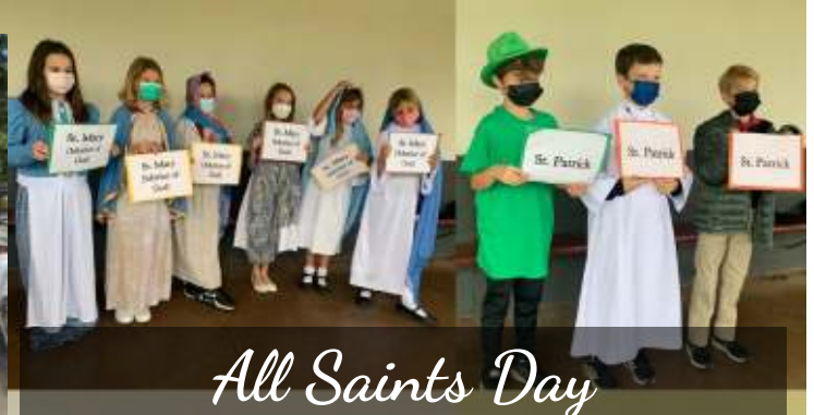
All Saints Day