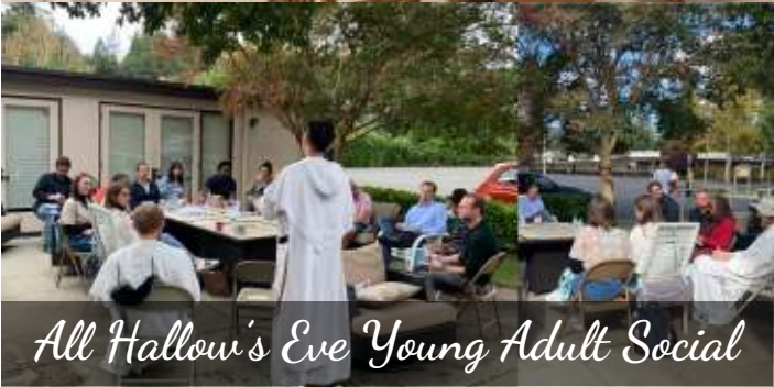
All Hallows' Eve Young Adult Social